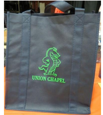
Reusable Shopping Bag $5