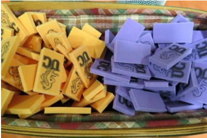
Color Changing Erasers or Pencils $0.50

How about something from the Gator Spirit Shop? We have items to fit every budget!