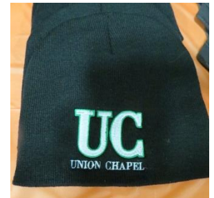
Winter Sock Hat $16

Long Sleeve T-shirts are also available for order for $16. To see samples, go to the UC Facebook page. For more information or to place an order, you can contact Tara Zimmer tarazimmer@sbcglobal.net Some items available immediately.