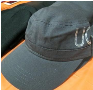
Ladies cap $12

Long Sleeve T-shirts are also available for order for $16. To see samples, go to the UC Facebook page. For more information or to place an order, you can contact Tara Zimmer tarazimmer@sbcglobal.net Some items available immediately.