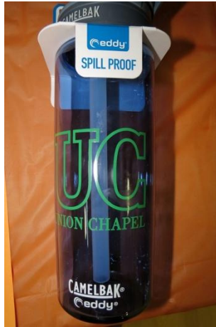
Camelback Water Bottle $18